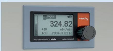
Panel Mounting Kit