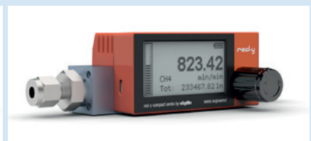
Various Inlet and Outlet Fittings